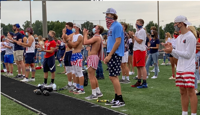
Pioneer fans at Friday's football game showed off their red, white and blue.